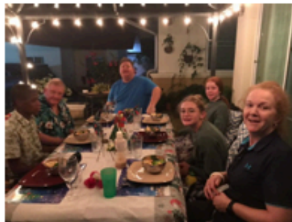
Christmas Dinner with family in Thailand