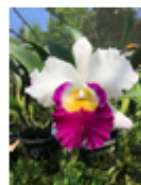
Orchid from Thailand

121 George Street, Edinburgh, EH2 4YN T: +44 (0)131 225 5722 E: FaithAction@churchofscotland.org.uk Scottish Charity Number: SCO11353