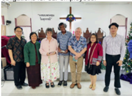
Church of Christ Leaders in Chiang Mai

We had a good family time over Christmas and New Year in a very beautiful part of Thailand. As well as enjoying being part of the lives of our children and grandchildren by visiting their school, and the local sights; we were also warmly welcomed by the local Church of Christ in Thailand. They invited us to lunch; we worshipped with them and were invited to a social time with their mission partners, mainly from South Korea. In this part of Thailand, around Chiang Mai, there is a fairly large christian minority. We arrived back in early January in good time to pay all the statutory obligations for our employees.