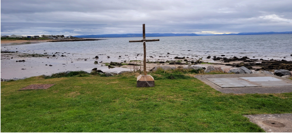
Cross at Portmahomack