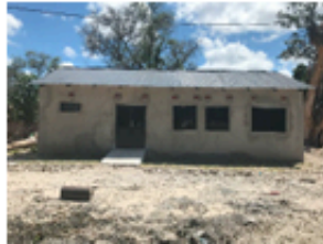
One Stop Centre