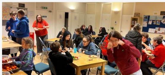
'Rookies & Steppers'

Our young leaders have been making incredible progress through the eXp Rookie Program! Over the past few months, they've been developing essential leadership foundations, growing in emotional intelligence, and stepping into real-life leadership roles at Pizza Church and Friday Night Club. It's been inspiring to see them take ownership, support one another, and serve faithfully each week. Their dedication and enthusiasm have made a real difference, and we couldn't be prouder of the way they're growing—not just as leaders, but as a team.