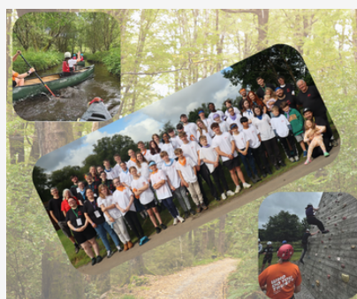
'eXp Summer Camp'

eXp Summer Camp 21-25 July 2025! This exciting holiday will once again take place at Whithaugh Park residential centre which is situated in the Scottish Borders countryside. There are a wide variety of activities included: a stunning bike skills course, music workshops, zip-line, crafts, sports/games, archery, canoeing, low ropes course, orienteering, wall climbing/abseiling, scavenger hunts and evening campfires with marshmallow roasts and barbecues! Our ever-popular morning and evening clubhouses are active and fun, providing a safe space to enjoy being together and considering ideas of abundant living by exploring our stories, Jesus' story and the story of others in the Bible. To find out more and how to sign up your young person please contact one of our team