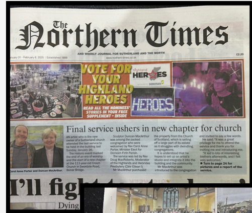
'Final service ushers in new chapter for church' news story by The Northern Times