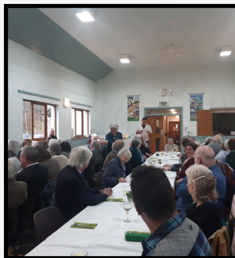
'A packed hall'