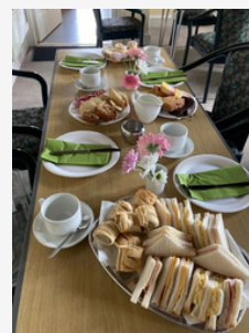
'Afternoon Tea for our Gaelic worshippers'

We hold Messy Church four times a year and have a great connection with our local school. In the summer months (May-September) we hold our Summer Sale in Inveraray Church Hall. This is our main fundraiser but it also provides a meeting space for our helpers and is a great place for a catch up. Many of our helpers are not church attenders but appreciate the role a church has in small town life.