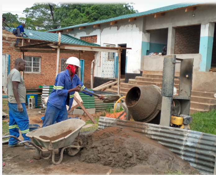
New Postgraduate Studies Centre currently being built